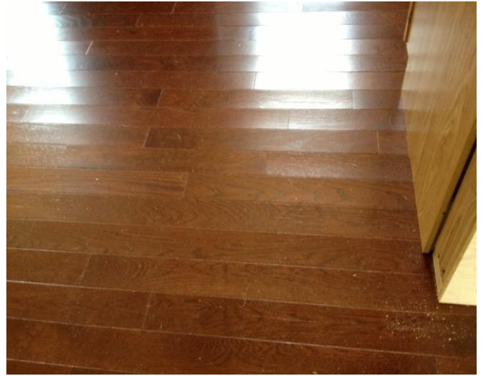
Examples of Cupped Flooring

FACT: Cupping results from a moisture differential between the face and back of individual pieces of flooring, usually excess moisture on the underside of the floor. Flooring also may cup when it experiences rapid drying on the surface, often during the heating season. More subtle cupping can be caused by lack of proper acclimation prior to installation (this is generally permanent cupping). To remedy cupping, identify and remove sources of excess moisture. For floors that have cupped due to drying, relative humidity should be increased. If boards are permanently cupped, the cupped edges may be sanded off.