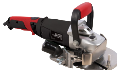
LONGNECK PLUS 6" Jamb Saw #10-56