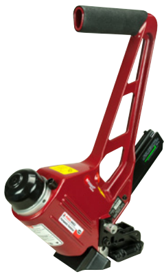
18 Gauge Floor Nailer #418A