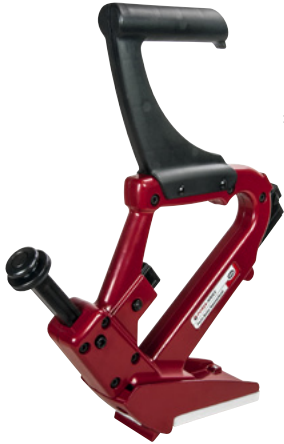
16 Gauge Manual Nailer #402A