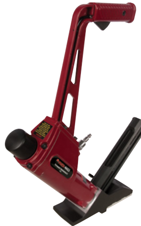
15 Gauge Floor Stapler #472A